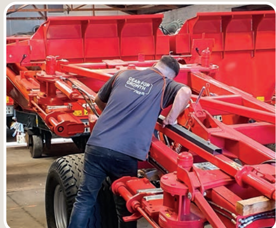
FROM TOP TO BOTTOM In-field demonstrations by our product specialists / We carry an extensive stock of spares for all our machines, with knowledgeable, helpful staff / Our technicians thoroughly inspect every machine during assembly